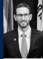
CA Senator Scott Wiener