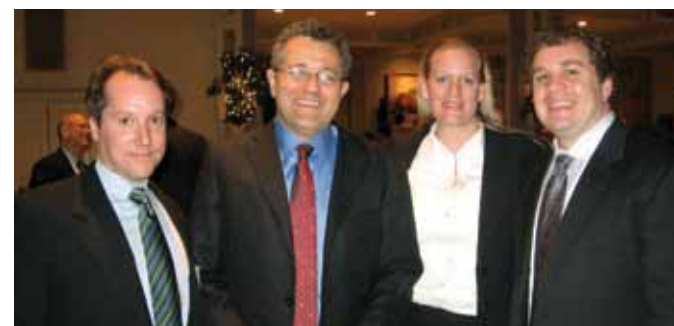
Author and CNN Senior Legal Analyst Jeffrey Toobin with Golden Gate Law Review Editors at the 2009 National Conference of Law Reviews in Baton Rouge, Louisiana.

Golden Gate Law is committed to providing an environment that fosters academic excellence and personal success. In 2009 we launched the