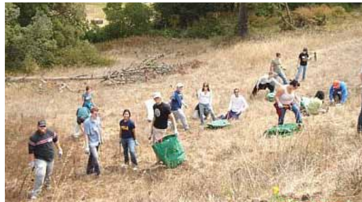
Golden Gate Law sponsors an annual public service project during Orientation. In 2010, students traveled to San Francisco's historic Presidio National Park to assist with ecological remediation.

Just beyond San Francisco, students frequently organize day or weekend trips to Yosemite National Park, Lake Tahoe, Napa and Sonoma Valley Wine Country and Big Sur. Los Angeles is an easy one-hour plane ride away.