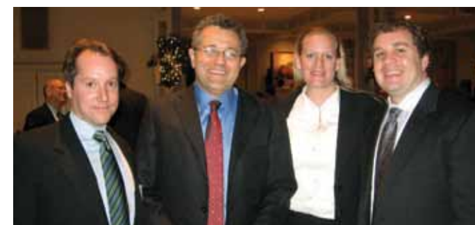
Author and CNN Senior Legal Analyst Jeffrey Toobin with Golden Gate Law Review Editors at the 2009 National Conference of Law Reviews in Baton Rouge, Louisiana.

Golden Gate Law is committed to providing an environment that fosters academic excellence and personal success. In 2009 we launched the