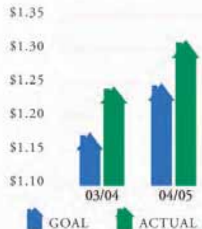
CalHFA Homeownership First Mortgage Production vs. Annual Goal, Last Two Fiscal Years (in millions)