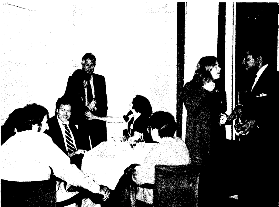
Alumni from eight different classes gathered for this year's Class Reunion.

Next year the Law School plans to sponsor an All-Class Reunion, which will offer all graduates a chance to reunite with their classmates. Specific details will be available later in the school year. Anyone with suggestions for this event can call the Alumni Office at 904-6835. ■