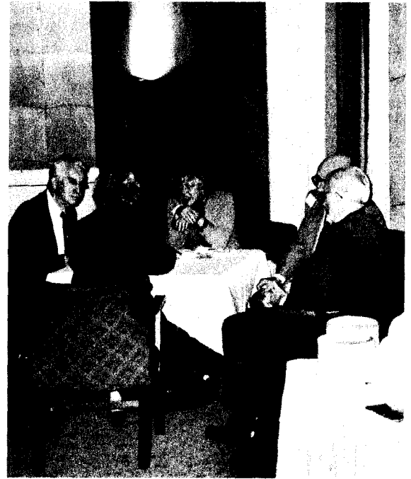
The S.F. City Club was the site of this year's Reunion.

The final event of the semester was the Annual Class Reunion. This year's get-together gathered members of the classes of 1952, 1957, 1962, 1967, 1972, 1977, 1982, and 1987. The reunion was held at the City Club of San Francisco, and more than 70 guests were present.