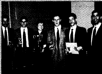
GGU Jessup Team

A team of five students competed against the University of San Diego, after successfully completing a number of preliminary rounds and defeating teams from Loyola, Stanford, Western State, and UC Davis. In addition to the second