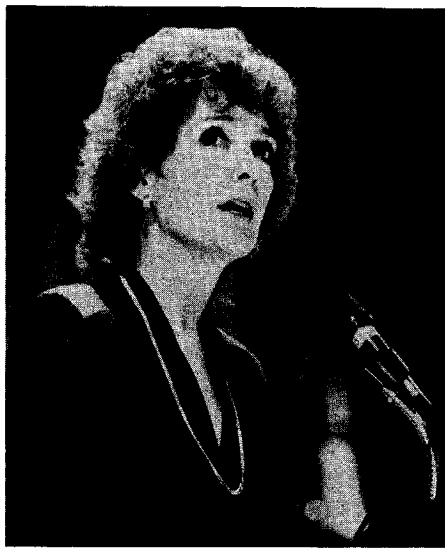
Chief Justice Rose Bird

"As new lawyers, you are going to be working hard. Whether you go into a large firm or hang out your shingle, a