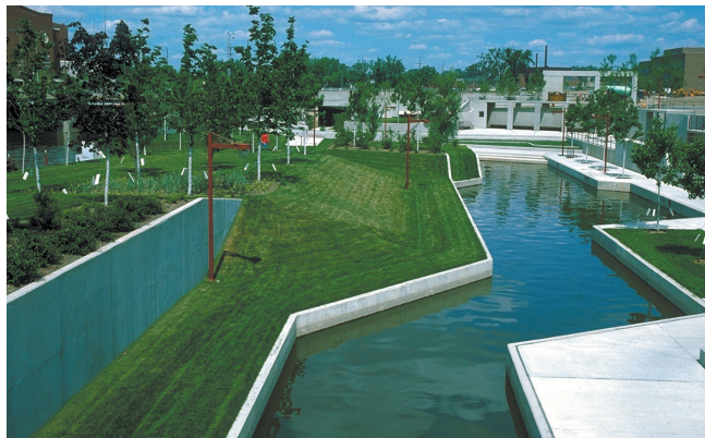
The US Army Corps of Engineers is considering restoring this stretch of the Flint River in Michigan, a vivid example of destructive Corps flood control projects.

O n November 18, 2005, Golden Gate University School of Law hosted an all-day law and policy symposium titled "City Rivers: The Urban Bankside Restored." More than 80 people attended—an indication of the strong interest in the topic. The event coincided with the recent publication of the special "City Rivers" edition of the GGU Law Review , which features articles on such urban waterways as the Guadalupe River in San Jose, the Los Angeles River, City Creek in Salt Lake City, the Chicago River, the Detroit River, and the Anacostia River in Washington, D.C. Some of the contributing authors to the "City Rivers" Law Review edition also made presentations at the on-campus symposium.