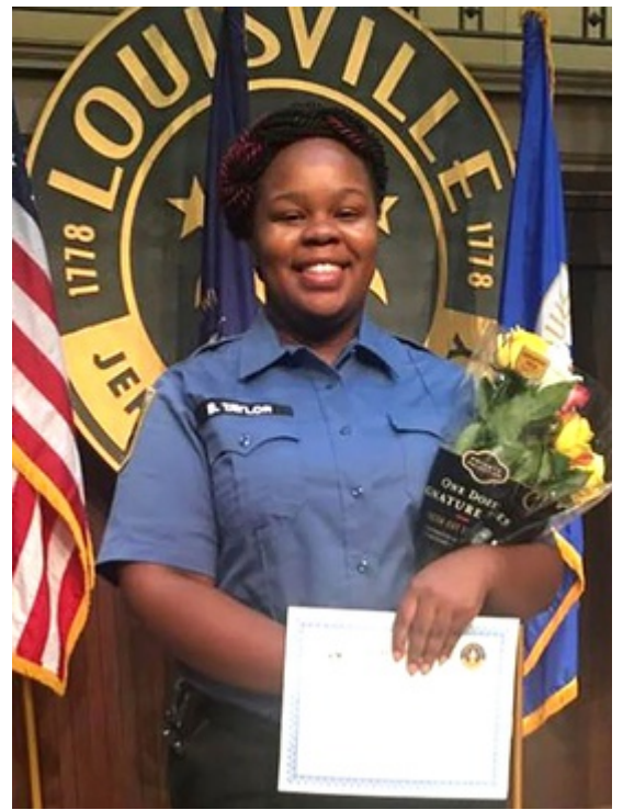
Breonna Taylor at a graduation ceremony in Louisville, Kentucky. Source .