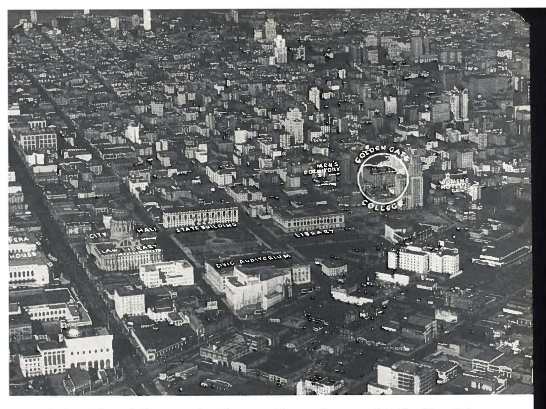
Birdseye View of Downtown San Francisco, Showing Location of Golden Gate College