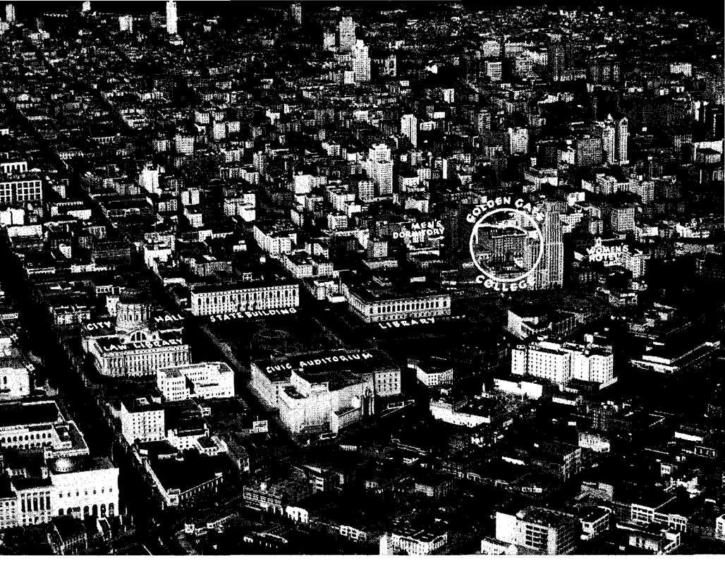
Birdseye View of Downtown San Francisco, Showing Location of Golden Gate College