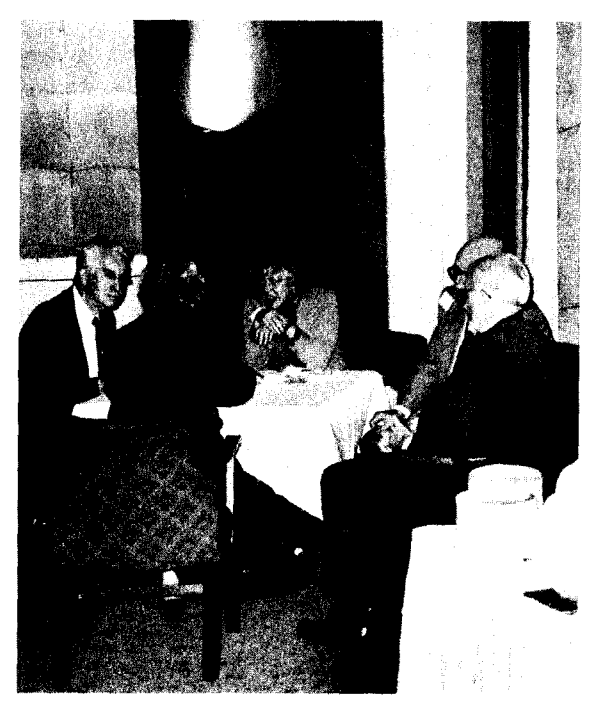
The S.F. City Club was the site of this year's Reunion.

The final event of the semester was the Annual Class Reunion. This year's get-together gathered members of the classes of 1952, 1957, 1962, 1967, 1972, 1977, 1982, and 1987. The reunion was held at the City Club of San Francisco, and more than 70 guests were present.