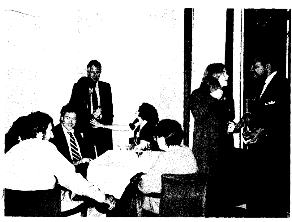
Alumni from eight different classes gathered for this year's Class Reunion.

Next year the Law School plans to sponsor an All-Class Reunion, which will offer all graduates a chance to reunite with their classmates. Specific details will be available later in the school year. Anyone with suggestions for this event can call the Alumni Office at 904-6835.