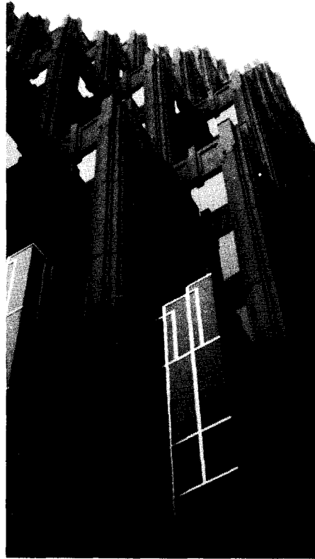
The Law School's new home is now at 49 Stevenson Street.

The 15th floor of the Stevenson building houses the Admissions Office, Registrar, Law Placement Center, and Alumni Relations Office. The offices of the Dean, Associate Deans, and some faculty members are also located on this