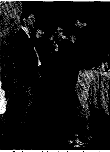
Students and alumni enjoy a wine and cheese reception after the conference.

within the legal field, the importance of work experience, and the advantages of a GGU law degree. In