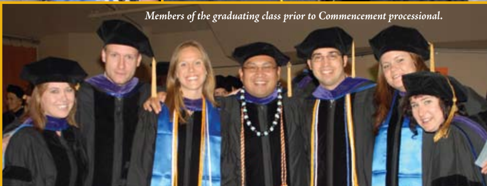
Members of the graduating class prior to Commencement processional.