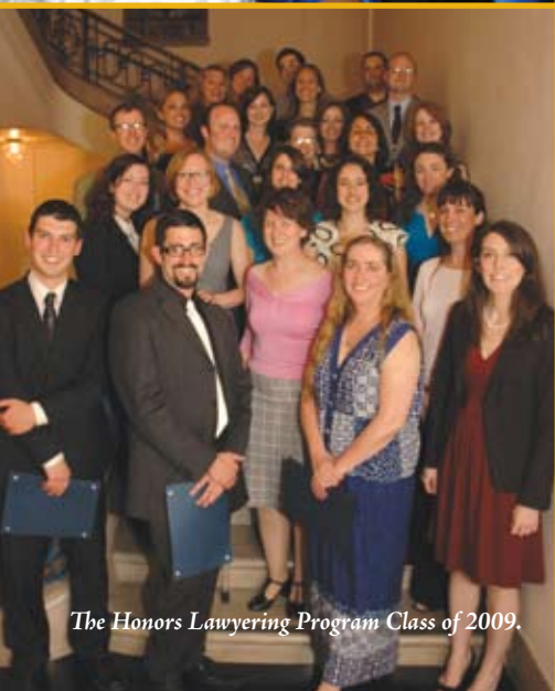
The Honors Lawyering Program Class of 2009.