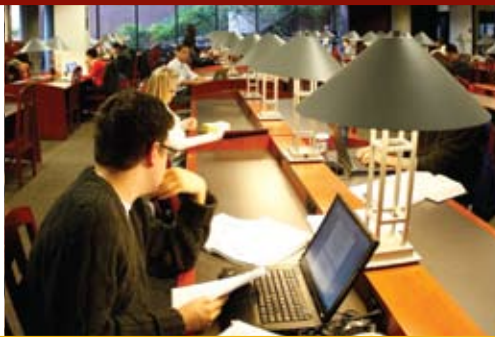
The New Law Library